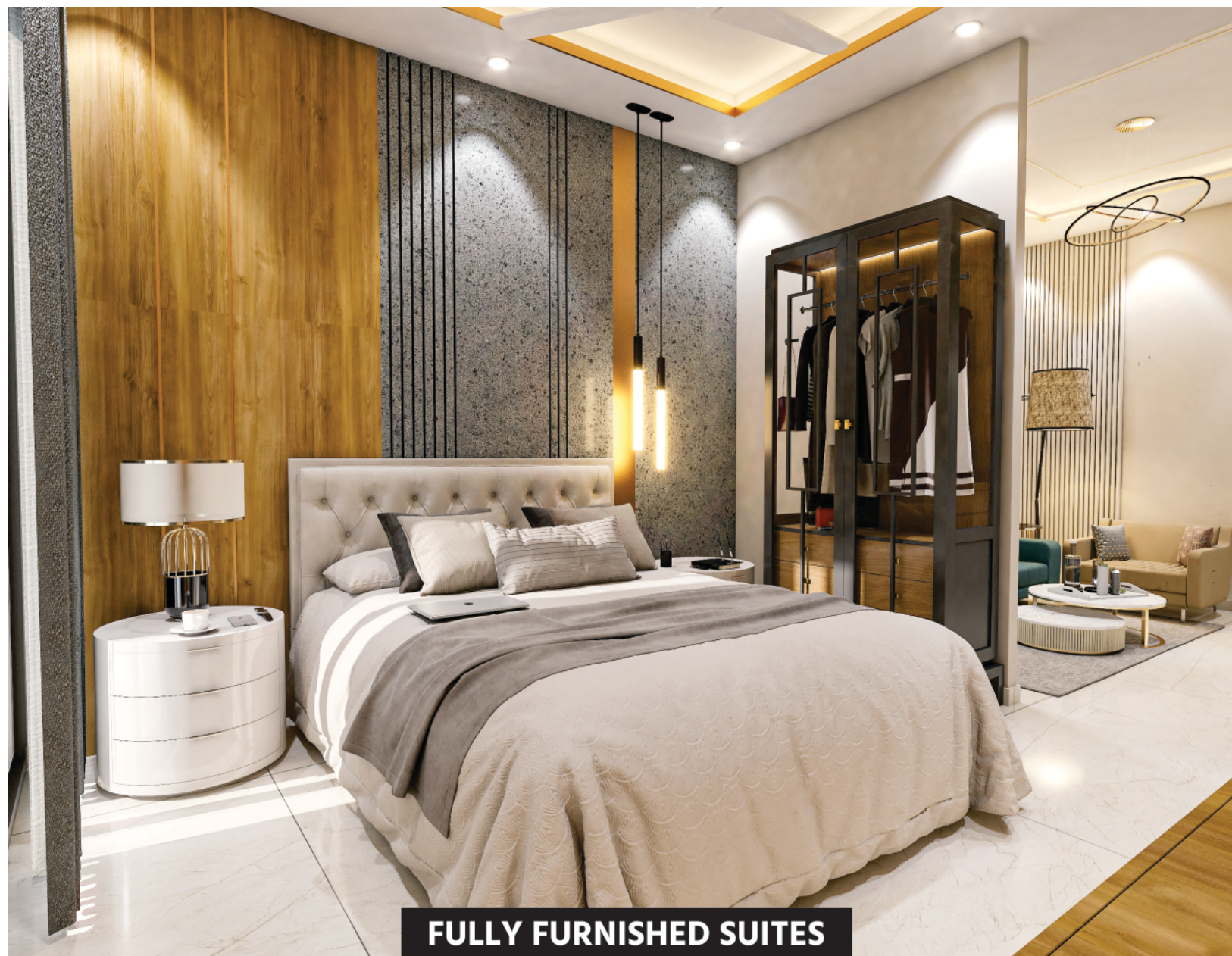
FULLY FURNISHED SUITES