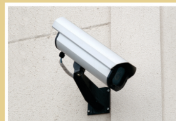
24x7 Security / CCTV